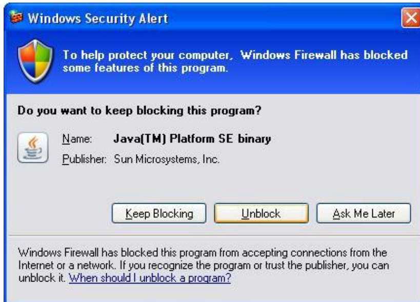
Fig. Java Alert