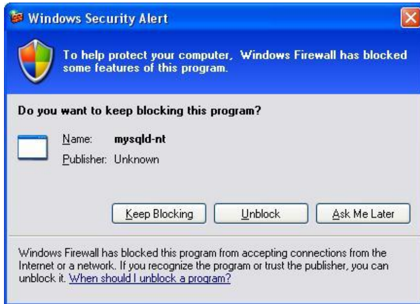
Fig. MySQL Alert

Unlock these programs to start Exchange Reporter Plus.